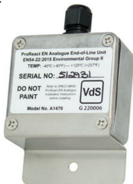
ProReact EN Analogue End-of-line Unit

The ProReact EN Analogue End-of-line Unit is compulsory in all ProReact EN Analogue LHD systems as it has a key role in the operation of the technology, allowing the control unit to detect a short circuit or open circuit in the sensor cable. It is small in size and is straightforward to be mounted on surfaces.