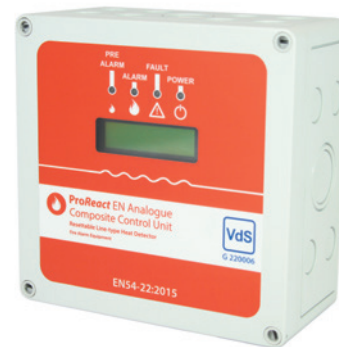
ProReact EN Analogue Composite Control Unit

More information relating to Thermocable's ProReact EN Analogue Composite Control Unit can be found in the product datasheet or installation manual, both of which are available on request.